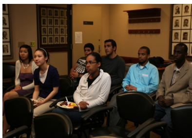
Pictured above: students in the 2010 and 2011 cohorts of CHE URP

For more information visit the website at: www.med.umn.edu/che